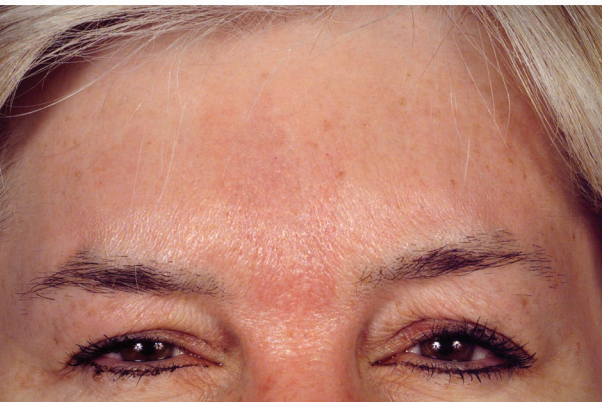
FIG. 2. Preoperative and postoperative views of a patient with migraine headaches, revealing the magnitude of corrugator supercilii muscle hypertrophy while frowning ( above ), and while attempting to frown ( below ) after removal of corrugator supercilii muscles, transection of the zygomaticotemporal branch of the trigeminal nerve, and temple soft-tissue repositioning.

temporal branch of the trigeminal nerve was part of this procedure, it prompted us to incorporate this maneuver into those patients who did not observe elimination of the migraine headaches after injection of Botox in the corrugator supercilii muscles. It is our belief that this nerve is another trigger point, being compressed by the temporalis muscle. Although the follow-up for this study group, by itself, is not sufficient to reach a convincing conclusion as to the long-term benefits of surgery, combining this study and the results of our retrospective study with an average follow-up of 47 months leaves no question that this method has an amaranthine effect on migraine headaches.